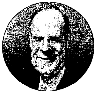
About the Moderator

BOGLE: First, put the client's interest ahead of your own, and, one day at a time, help to make this field of investing more of a profession and less of a business. Second, learn every day, but especially learn from the experiences of others. It's cheaper! And third, never, never lose your idealism, no matter how rough your career might be, and never lose faith in your nation. //