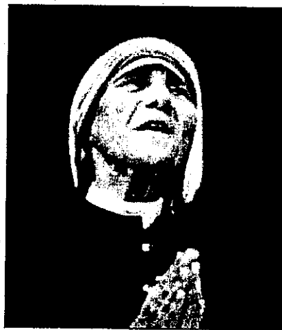
Mother Teresa won the first Templeton Prize in 1973. Other recipients of the prize include Bill Bright, Charles Colson, and Billy Graham.

"Progress is needed in spiritual discovery as in all other dimensions of human experience and endeavor," said Templeton. "The Templeton Prize serves to stimulate this quest for deeper understanding and for pioneering breakthroughs in religious concepts and knowledge by calling attention annually to achievements in this area." //